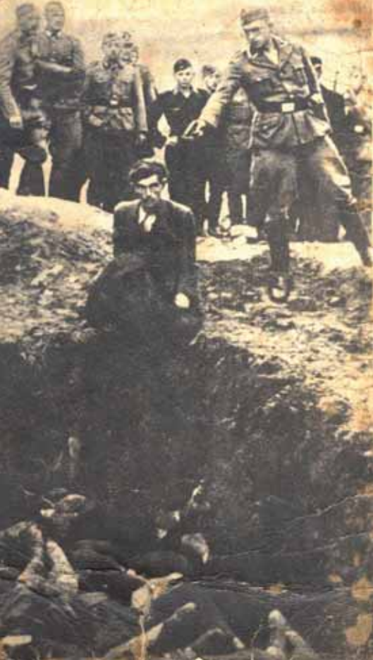
Vinnitza, Ukraine, German soldiers watching an Einsatzgruppen soldier murder a Jew, July 1941

in attacking and almost destroying the Jewish population, not only of Germany but of most of Europe, will raise awareness about the roles and responsibilities of the State, of individuals and of society as a whole in the face of increasing human rights violations. An examination of the actions of German doctors and nurses in the so-called "Operation T4" euthanasia program of Nazi Germany (which led to the killing of more than 200,000 mentally or physically disabled men, women, and children over six years) is another example. Likewise, the participation of regular German soldiers in the killing of over one million Jews as part of the work of the Einsatzgruppen (special killing squads) in the eastern parts of Europe, leads to questioning human behaviour, conformism and the power of ideologies; in short, the adhesion of a society to a government undertaking actions that violate internationally recognized human rights. Educating about the Holocaust can help young people to understand key concepts that will be useful when studying other examples of mass violence. When pupils explore the history of other massive human rights violations, they will be able to draw on their understanding of the Holocaust and become more aware of their own responsibilities as global citizens.