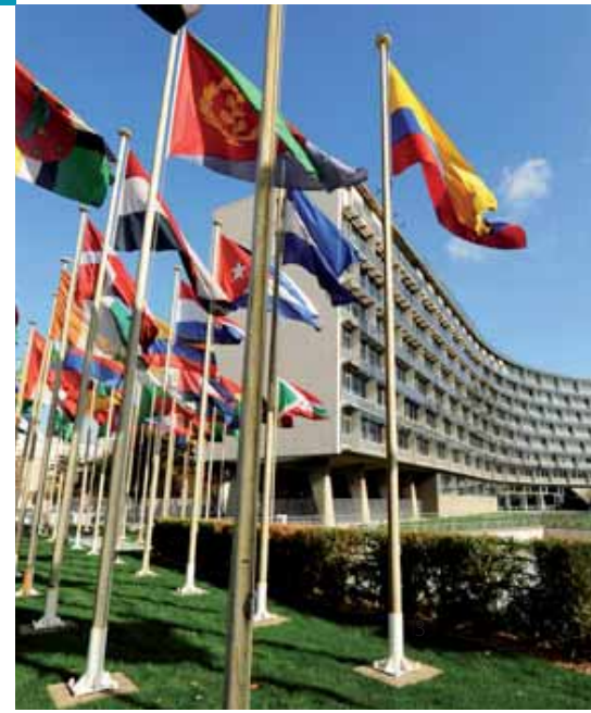
UNESCO Headquarters in Paris

UNESCO's mission is to contribute to the building of peace, the eradication of poverty, sustainable development and intercultural dialogue through education, the sciences, culture, communication and information. UNESCO believes that it is essential to learn about the Holocaust to better understand the causes of Europe's descent into genocide; the subsequent development of international law and institutions designed to prevent and punish genocide; and that the careful comparison with other examples of mass violence may contribute to the prevention of future genocides and mass atrocities.