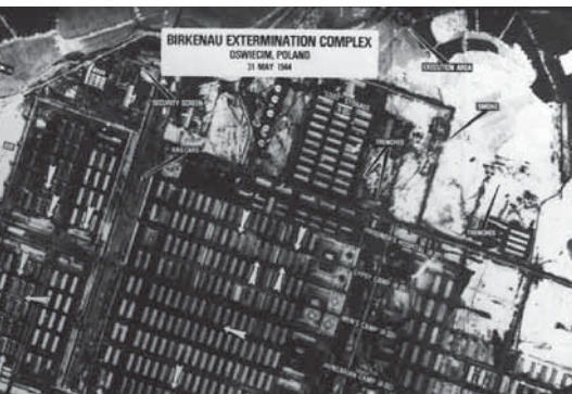
The Auschwitz-Birkenau German Nazi Concentration and Extermination Camp was inscribed on the UNESCO World Heritage List in 1979

The use of radios in the genocide of the Tutsi in Rwanda in spreading racist propaganda and helping killers to identify victims also makes this unmistakably clear. Such awareness of the power of technology can help students when examining contemporary issues of human rights violations which, in turn, can lead to political action to prevent such violations. This is important given the profound changes in technology over the past years.