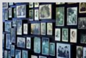
Exhibition of family portraits at Auschwitz-Birkenau State Museum

process. It facilitates the understanding of specificities and differences between events of mass violence. However, while it is educationally valuable to conduct a comparative study of genocides, it is critically important not to attempt a comparison of suffering. Educators should concentrate on the various destructive policies carried out by Nazi Germany and its collaborators when undertaking a study of the Holocaust. When examining other genocides,