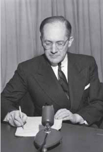
Dr Raphael Lemkin, who coined the word "Genocide"

Regardless of geographical location, all human cultures, over the course of time, have engaged in the killing of other humans. As the power of weapons of destruction has grown, so have the number of people killed by other human beings. Alongside the genocide of European Jewry, Nazi Germany also carried out a genocide of the Roma (a crime sometimes called the Porajmos, "Great Devouring", or Samudaripen, "Great Dying"), a mass murder of the Poles, and a mass killing programme of the disabled. They committed mass murder of more than three million Soviet prisoners of war, killed countless civilians in occupied territories, and murdered tens of thousands more through persecution of political opponents, homosexuals and Jehovah's Witnesses. So traumatic was this assault on human values, a new word was coined during World War II by a Polish-Jewish lawyer, Raphael Lemkin, to describe it: genocide.