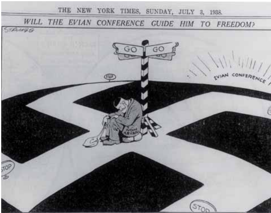
A British cartoon reflecting the hopes that are placed in the Evian Conference—This meeting, to be at Evian, France, on Wednesday to arrange for the emigration of political refugees, was called at