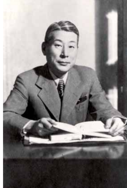
Chiune Sempo Sugihara, the Consul General of Japan in Kovno, issued more than 2,000 visas, thus helping Jewish refugees escape Europe.

On another level, this power of action can be seen for instance in the deeds of some religious leaders to challenge the “T4 euthanasia” policy of the Nazi leadership to murder disabled people in the German Reich. Remarkable also are the actions of the non-Jewish German women who, in February 1943, protested against the arrest of their Jewish husbands in the so-called “Rosenstrasse” demonstrations. Their protests intensified until the men were released in March 1943. These examples demonstrate that constructive individual and collective action can sometimes positively influence oppressive regimes that deny their citizens basic human rights.