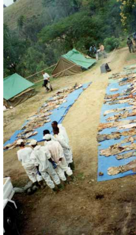
Mass grave in Rwanda

What can be learned about preventing genocide and mass atrocities through study of the Holocaust and other Nazi crimes?