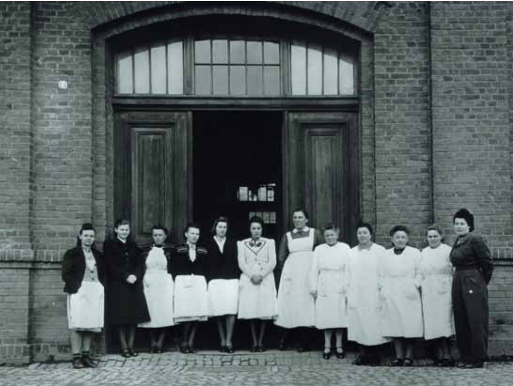
Nursing staff at the Hadamar "euthanasia" centre, Germany