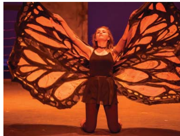
Benjamin Russell High School student performing at L'Chaim .

"After we took our pictures with the survivors, we were walking back to the dressing room and one of the survivors came up to us and showed us her number... That is something that I'll never forget."