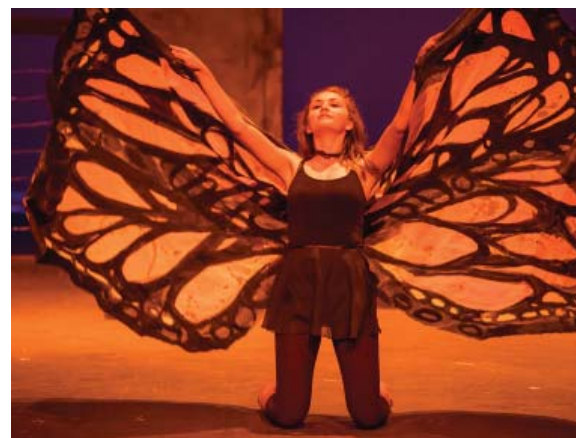
Benjamin Russell High School student performing at L'Chaim.

"After we took our pictures with the survivors, we were walking back to the dressing room and one of the survivors came up to us and showed us her number... That is something that I'll never forget."